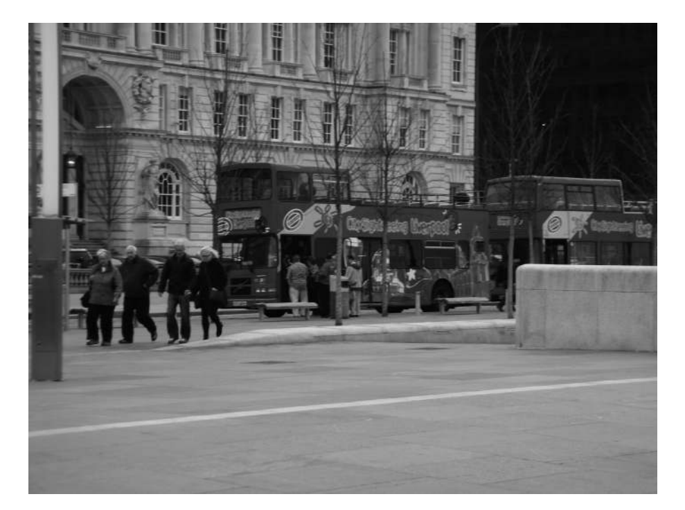
Fig. 6 for Question 4